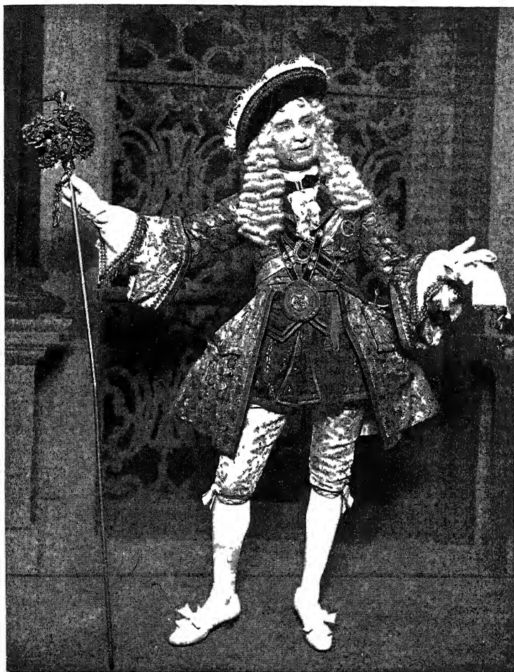
HENRY LYTTON AS THE DUKE OF PLAZA-TORO